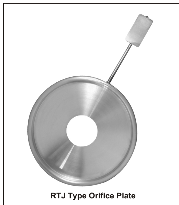
RTJ Type Orifice Plate

RTJ type orifice plates can be supplied complete with ANSI B16.36 orifice flanges. Please refer to Product Data Sheet FM-CR/FLGA for further details. Meter runs are also available.